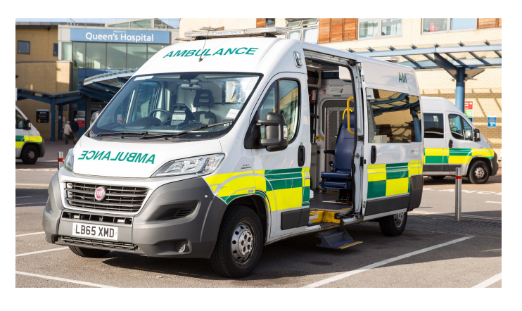
Who can apply for the NHS Patient Transport Service?

In some cases, people may be able to use the Patient Transport Services commissioned by the Integrated Care Boards (ICB).